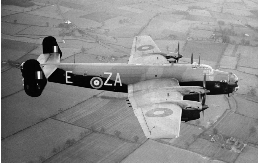
(Above) A Handley Page Halifax Mk.II of No.10 Squadron, photographed here on December 12, 1941. A Navigator of the later Halifax aircraft stated that the Mk.IIs were known as 'Widow Makers' or 'Death Traps' as they were underpowered and very difficult to recover from a stall, hence the change from triangular tail fins to large rectangular ones later on. (Below) A birds-eye view of a Handley Page Halifax Mk.II.