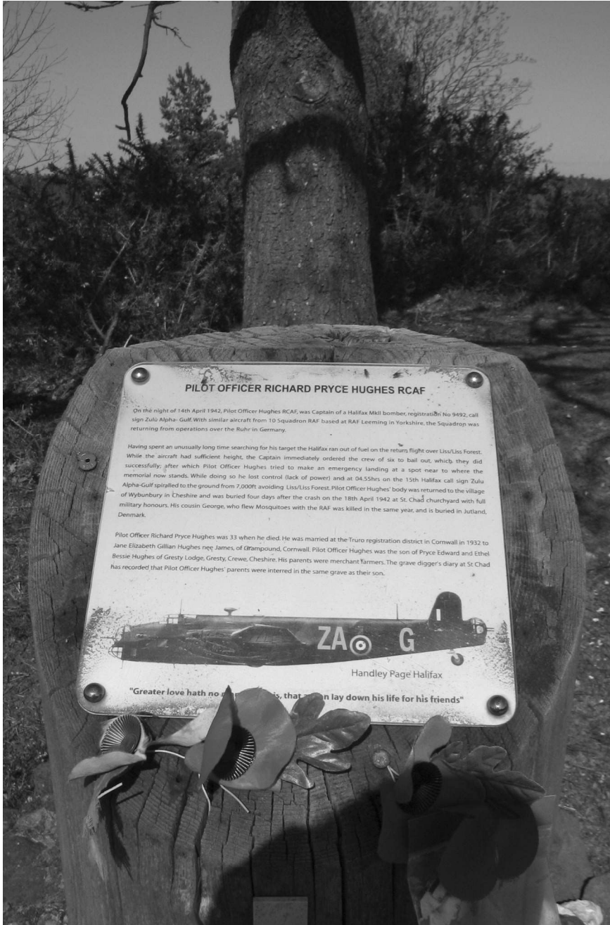
The updated memorial.