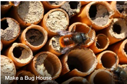
Make a Bug House

A five-minute craft activity for you to enjoy making over the season.