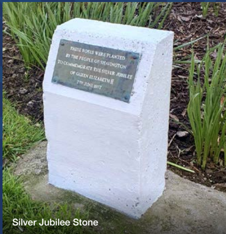
Silver Jubilee Stone

For Queen Elizabeth's II's Golden Jubilee in 2002, the Festival Committee donated money to Shavington-cum-Gresty Parish Council to change the roses to those gold in colour.