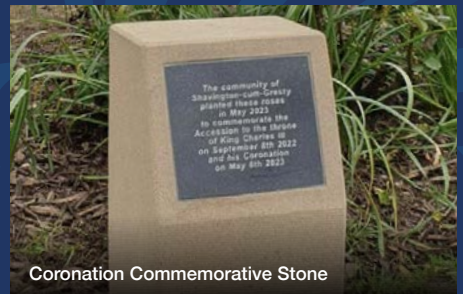
Coronation Commemorative Stone

It was a well-attended celebration with almost one hundred Community members joining together for this historic occasion.